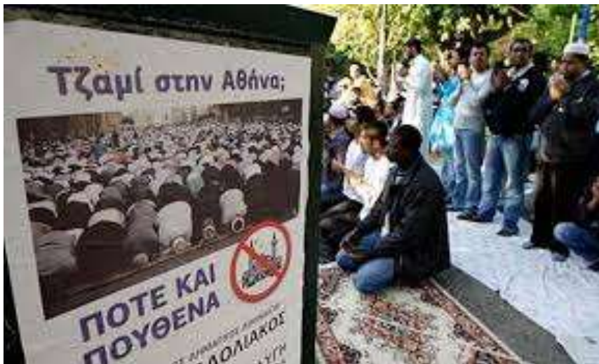
Photo of a counter protest in favor of the mosque construction.

The teacher asks the students to study the arguments of those who oppose the construction of the mosque in Athens and then to argue in favour of the mosque construction.