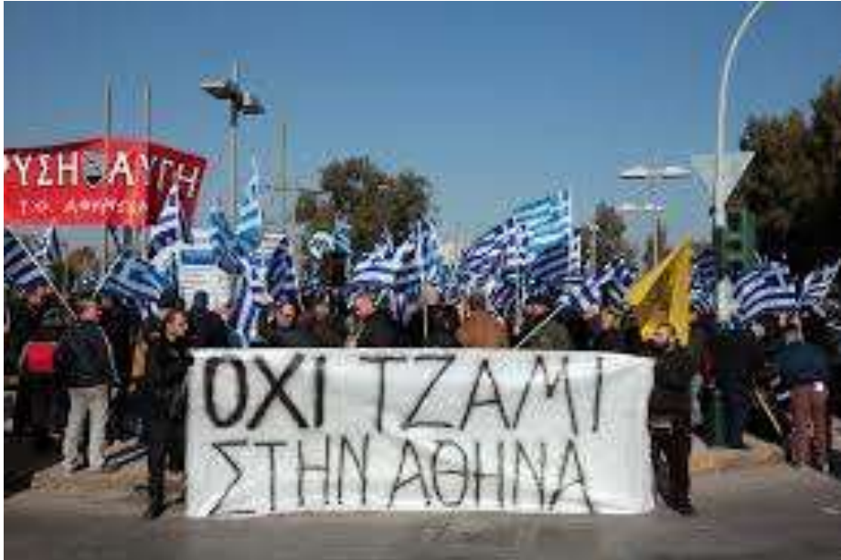
Photo of a rally against the mosque construction. The banner reads: no mosque in Athens.

Next, the students are given material from groups that oppose this plan.